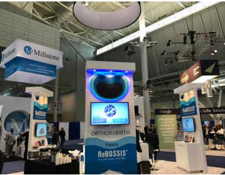
Exhibition at the 31st NASS's Annual Meeting organized at Boston Convention and Exhibition Center in Boston, Massachusetts.