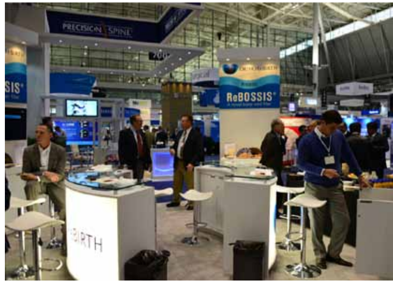
Just as in the previous exhibitions, lots of medical doctors gathered at our Booth, showing how busy our booth was. The popularity toward ReBOSSIS remained as high at that time as before.